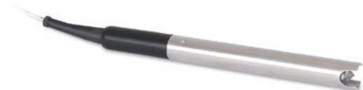
Model 122M P8 Probe

The 122M uses the P8 Probe, which is 5/8" in diameter (16 mm) and stainless steel. It is pressure proof, up to 500 psi. The beam is emitted from within a Hydrex cone-shaped tip. The tip is protected by an integral stainless steel shield, and is excellent for the vast majority of product monitoring situations. A cleaning brush is included with each Meter.